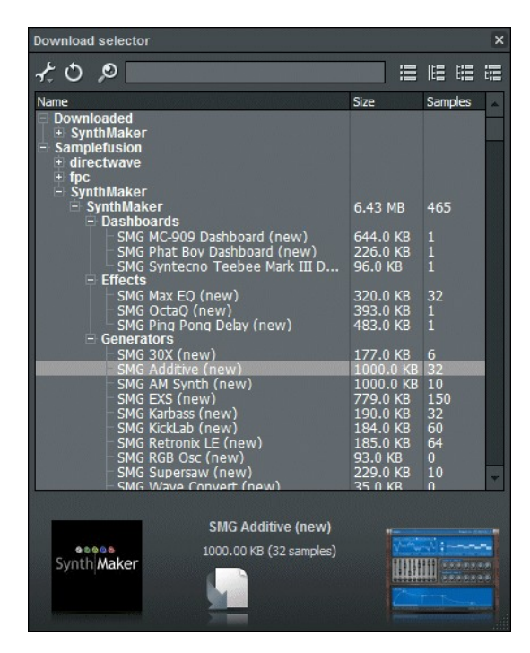
Image Line has provided a mechanism for downloading free content directly into FL SynthMaker from their web site. Click the Download button and the Downloader window will appear.

From here you can choose to download content or select from previously downloaded content. For more information on how to use the Downloader see the FL Studio help.