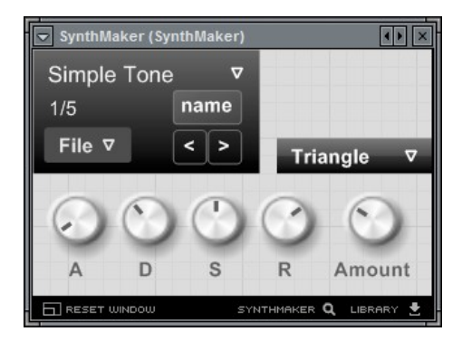
After pressing Show Panel